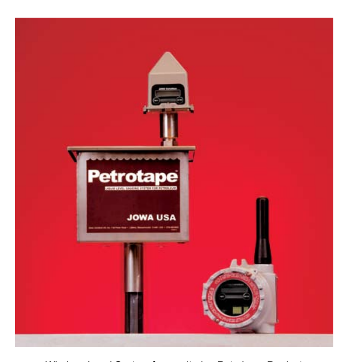
Wireless Level System for monitoring Petroleum Products

Access remote sites via computer with a modem or the internet and avoid unnecessary travel.