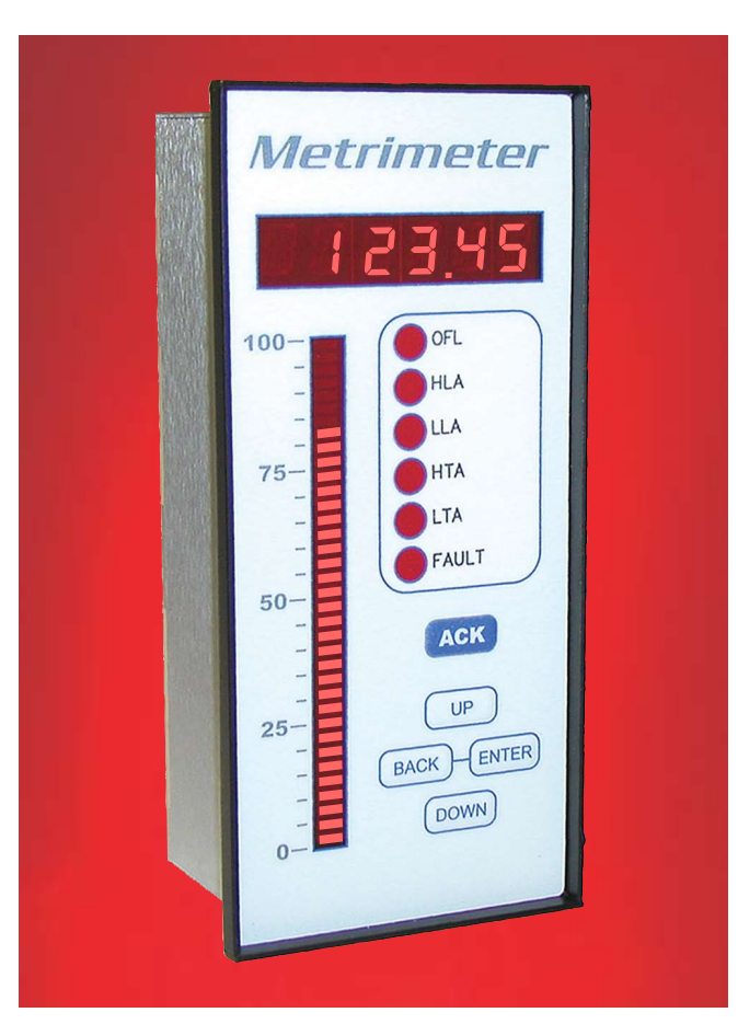
Metrimeter Single Tank Monitoring System