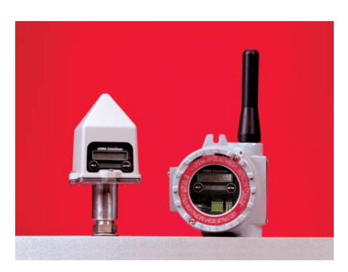
Wireless model WRT & WBR allow for quick and easy installations

The FCC license-free WRT allows for level monitoring in places that were previously thought