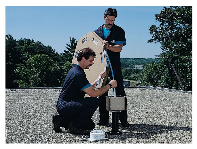
Flexible resistance-tape sensors are easily installed from tank top

These level gauges are easily installed from tank top by dispensing the flexible sensor from its reel into a customer supplied still pipe of PVC or steel. For some non-agitated tanks, a specially weighted sensor can be used without a stillpipe.