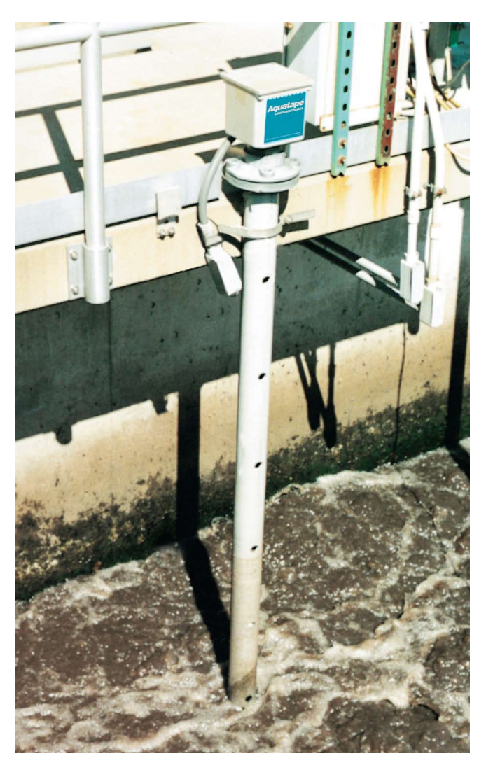
Resistance-tape level sensors are unaffected by agitation or foam

cost prohibitive due to the expense of running wire or adding a power source. The FM approved intrinsically safe field unit is suitable for installation in hazardous areas without the use of IS barriers. The power is derived from a 3.6V lithium battery that lasts 3 to 5 years with update rates as fast as once per second. The maximum line of sight range is 3,000 feet or 500 to 1000 feet for applications with obstructions.