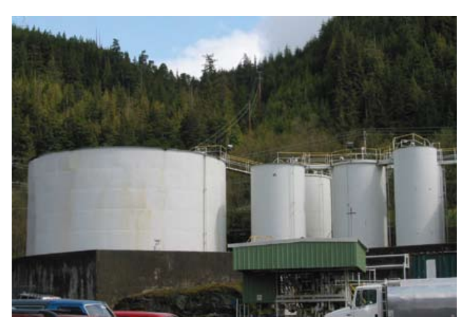
Fuel Storage Tanks with Wireless Level and Temperature Monitoring

The systems are easy to install and the tank does not need to be drained or taken out of service as sensors are installed from the top. If you don't already have wire or power at the tank the wireless level system is the most cost effective method to monitor your tanks. A battery powered field unit mounted on top of your tank transmits level or temperature to a base radio.