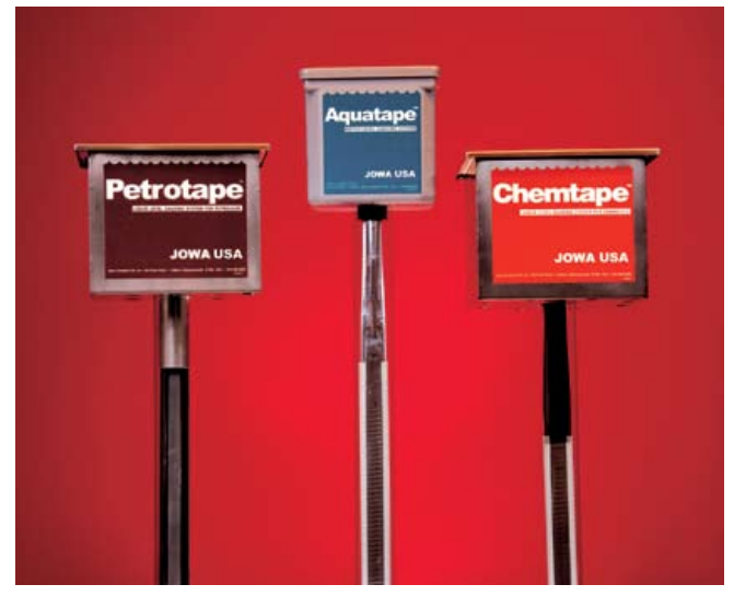
Aquatape™, Petrotape™, and Chemtape™ level gauges

The helix winding is gold plated nichrome, 4 turns/inch, 1000 ohms/meter (305 ohms/ft.) resistance gradient and provides 1/4" resolution.