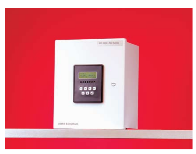
Multi-Channel Monitoring System MC-2200 Series